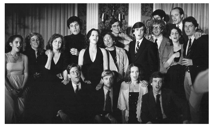
The Williamstown Theatre Festival in 1980 where I met Austin Pendleton The Gershwin Cabaret