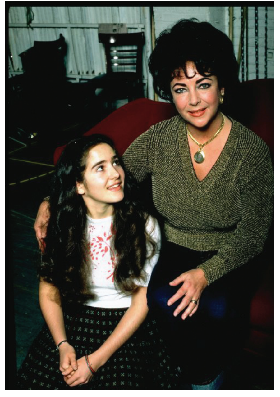
"We opened, May 7, 1981."