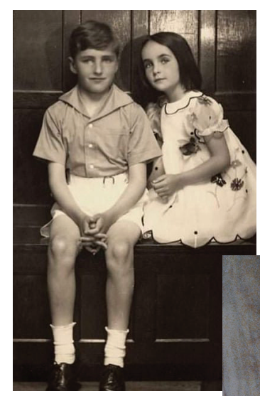
older brother whom we adored."