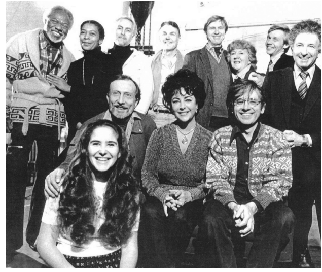
"I got the job!" Rehearsal at The Golden Theatre 1981